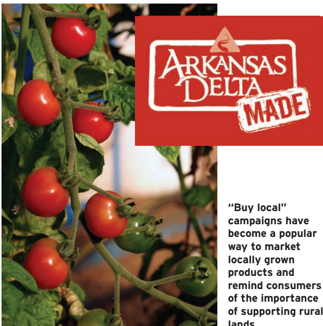
"Buy local" campaigns have become a popular way to market locally grown products and remind consumers of the importance of supporting rural lands.

Priority funding areas (PFAs) identify geographic areas that qualify for financial or other assistance, such as infrastructure or accelerated project approval. Typically designated at the state level and supported by local decisions, PFAs create incentives for development to take place in particular areas, including those where infrastructure exists already, while removing incentives for growth pressure in undeveloped areas. Connecticut identifies PFAs as regional centers, growth and redevelopment areas, and distressed municipalities. The state specifically requires that state agencies "cooperate with municipalities to ensure that programs and activities in rural areas sustain village character." 27