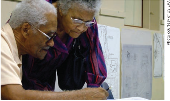
Residents can help determine priorities for preservation and new growth.

assist in stormwater management and reduce the heat island effect; using the public right-of-way for multiple purposes, such as trails that can permit both stormwater management and recreation; and strategic plantings to allow biofiltration to treat runoff and improve water quality. A more specific example might be a tree canopy that absorbs excess runoff, lowers roadway temperatures, and improves air quality. This kind of amenity not only reduces infrastructure demand but also can improve a community's appearance and help it support active transportation, including walking and bicycling.